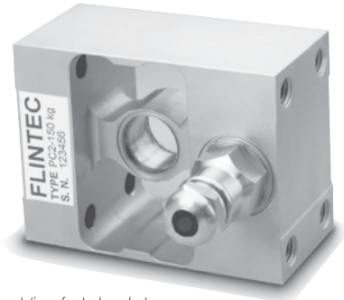
Picture is a representation of actual product