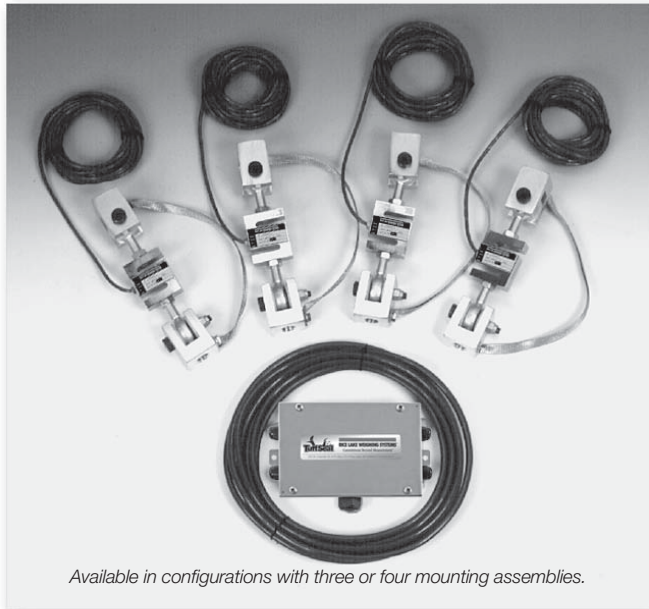
Available in configurations with three or four mounting assemblies.

Picture is a representation of actual product